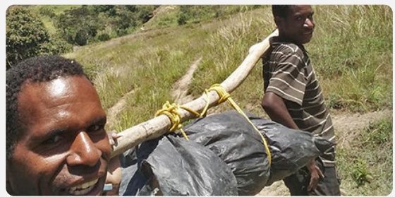
PRESSED BUT NOT CRUSHED