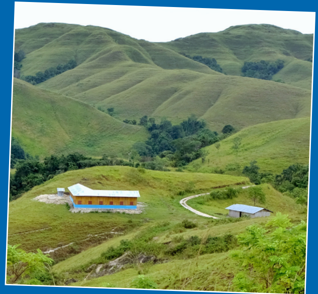
Mustard Seed helps build schools, like this one on Sumba Island.

Get creative! Use crayons, markers, or colored pencils to design your idea of the perfect school. Would it have big classrooms? A playground? A garden? As you draw, pray for Mustard Seed to have the resources they need to build real schools like the one in your drawing. Send your drawing to Mustard Seed and we'll share your drawing with kids in remote villages to bring them joy and show them you care!