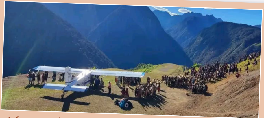
A faraway village in Papua has no electricity or roads, and the only way to get there is by flying in a small plane!

But there's hope! We can pray and ask God to provide everything these kids need to learn and grow—electricity, internet, and the supplies to help them succeed. God hears our prayers and can do amazing things to bring light, learning, and hope to their lives!